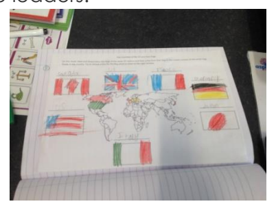
Year 3 - Rhys

For locating the G7 countries on a map, recognising the seven flags and naming the leaders.