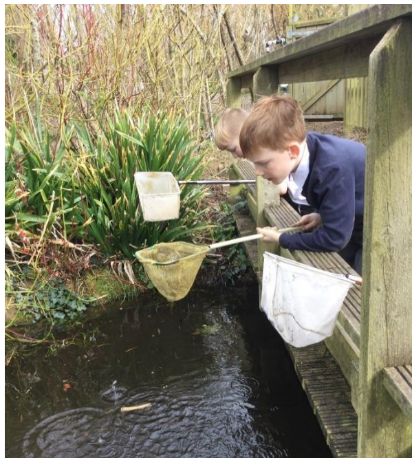
Year 5 pond dipping.

Our children have experienced a fantastic term of outdoor learning set within our own outdoor classroom and Cultivating Futures area, in addition to visits off site. The benefits of accessing the outdoor environment both in terms of children developing their knowledge and understanding of the world and also in supporting their emotional health and well being, have been clear to see.