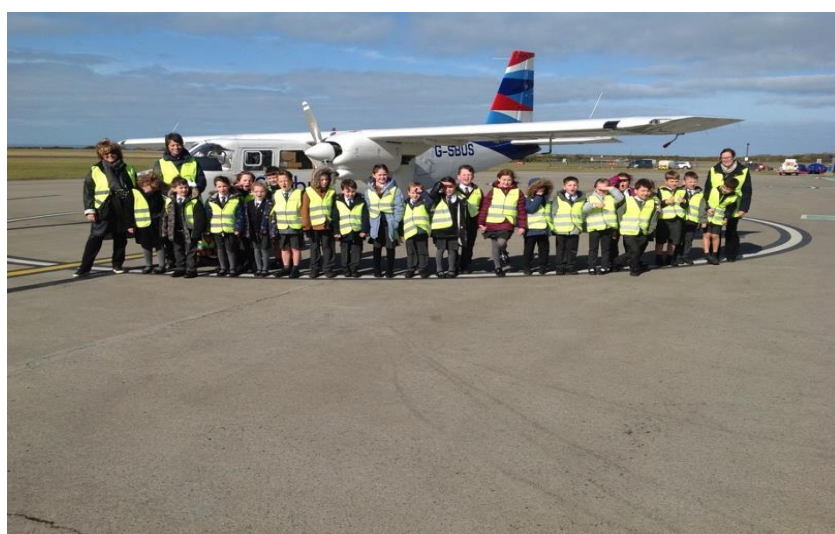
Year 2 enjoying an exciting visit to Lands End airport as part of their topic on the history of flight.