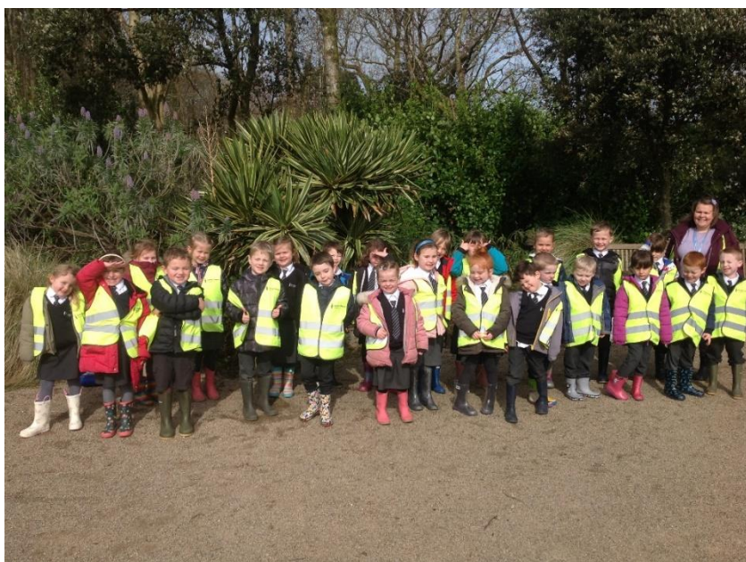
Year 1 visiting Trengwainton Gardens as part of their topic, 'Brilliant Bodies' exploring their senses.