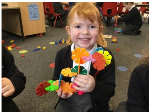
EYFS being creative.

Each class teacher has created a spring term year group newsletter to showcase the amazing work which has been produced by the children. I hope that you enjoy reading these pages and can share with us the wonderful learning which has been taking place.