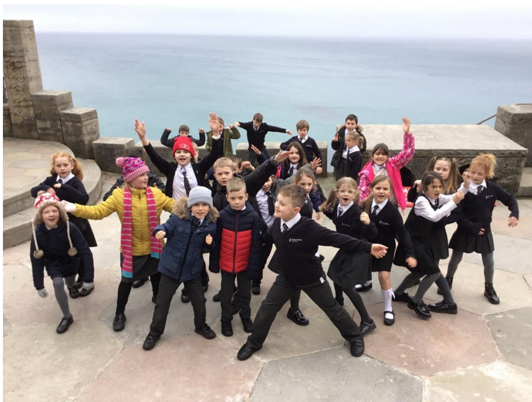
Year 4 acting out a scene from 'The Tempest' at the Minack Theatre.

School trips to support the current learning in class have taken place and our children have visited a range of different sites to enhance their learning.