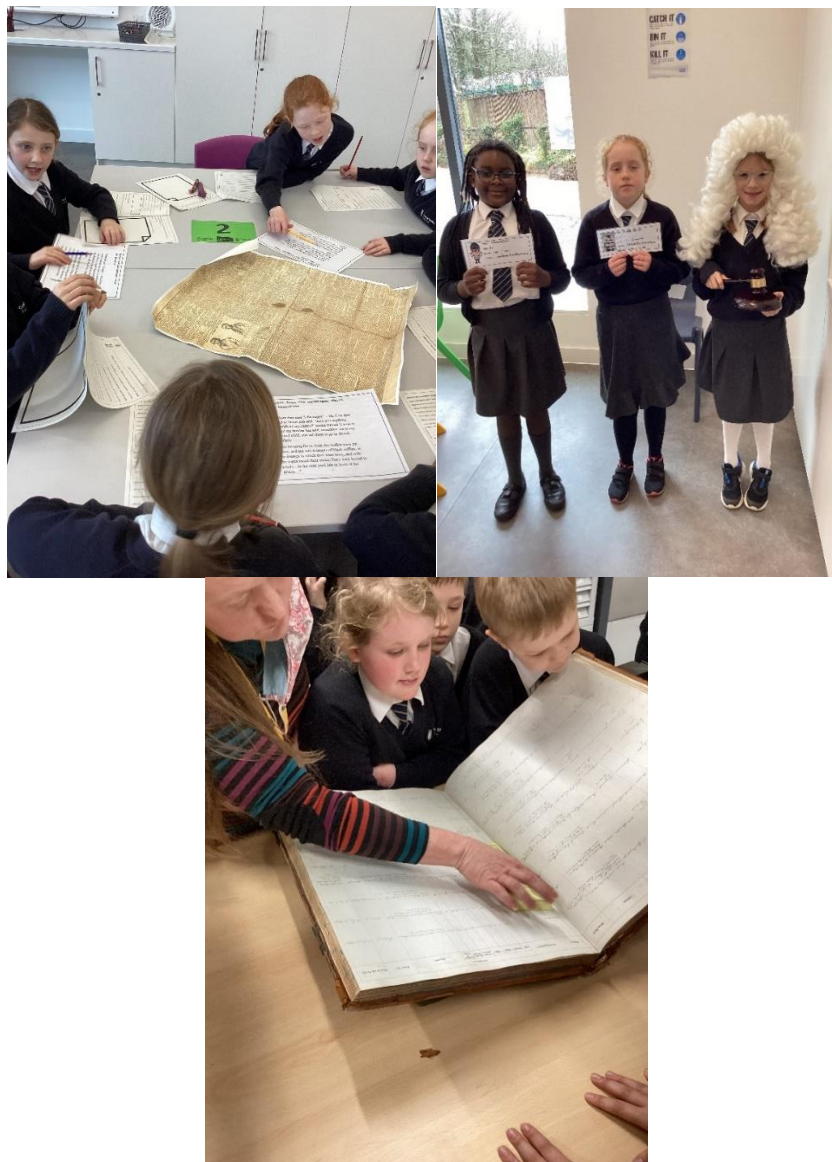
Year 4 Kresen Kernow visit

As part of their topic on crime and punishment topic, Year 4 enjoyed a fascinating visit to Kresen Kernow in Redruth – the home for Cornish archives.