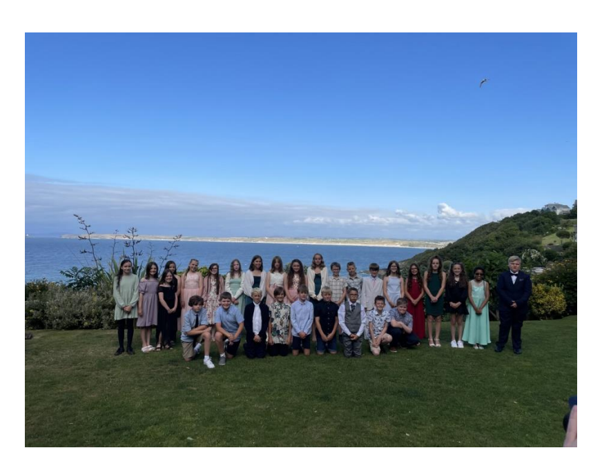
Year 6 Prom.

I hope that you enjoy reading these pages and can share with us the super learning and experiences which the children have enjoyed.