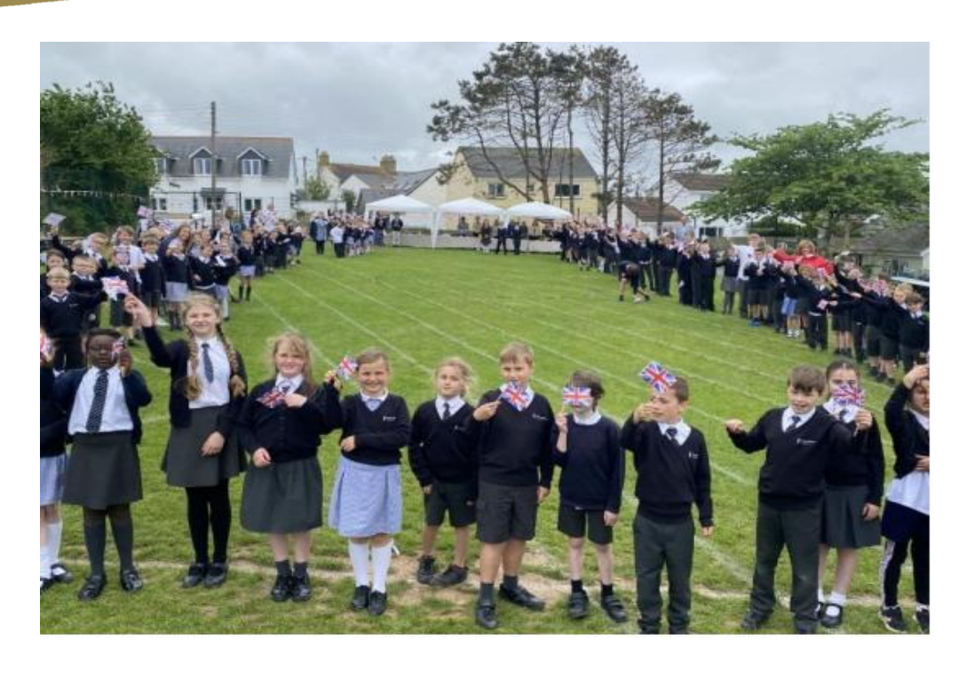
Whole school celebration of the Queen's Platinum Jubilee.

What an incredibly, busy, exciting and successful summer term we have enjoyed at Connor Downs Academy!