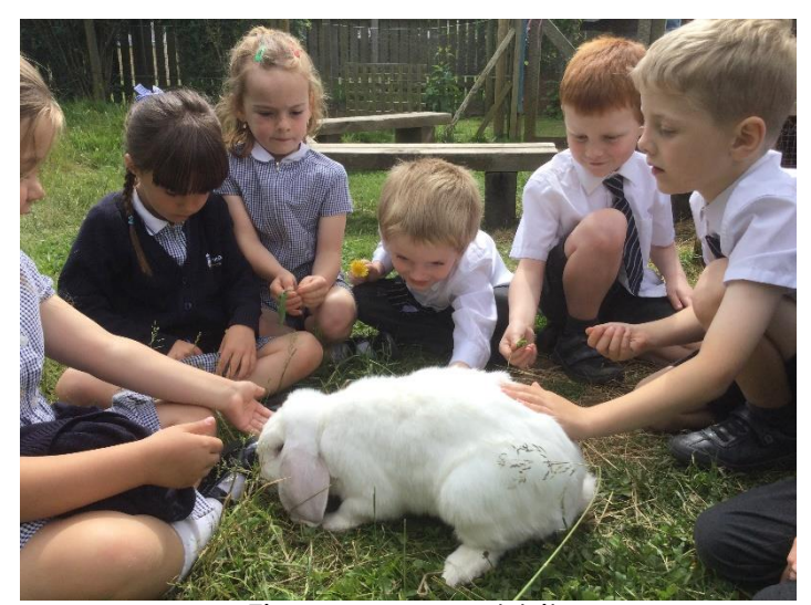
Zinc, our new rabbit.

Year 1 children, along with the rest of the school community, have been delighted to welcome Zinc, our newest rabbit to join our family. Zinc has settled in so well and is a favourite with children, staff and visitors alike.